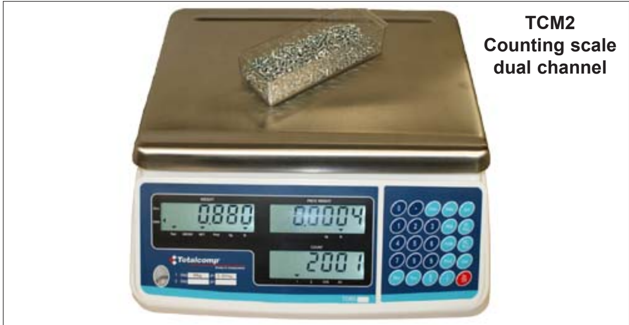
TCM2 Counting scale dual channel