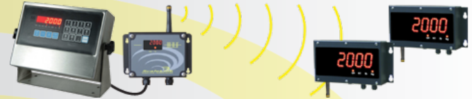
SCALE TO MULTIPLE REMOTE DISPLAYS