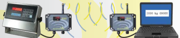
SCALE TO PC (1 OR 2 WAY COMMUNICATION)

* 2 ScaleLinks required for wireless communication between devices.