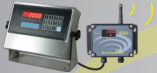
SCALE TO REMOTE DISPLAY