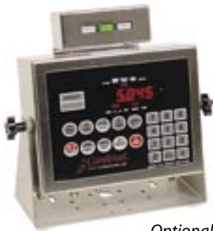
Optional Checkweigher Light Bar for Model 210