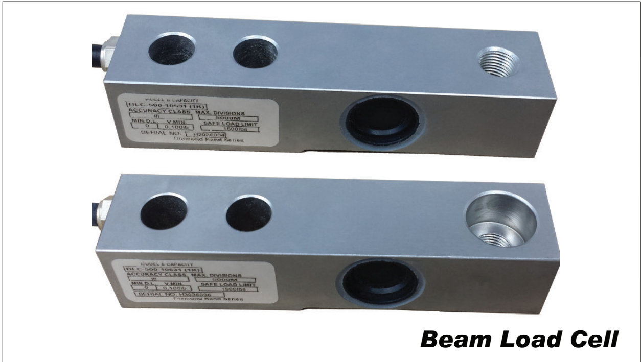
Beam Load Cell