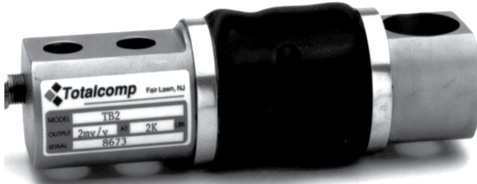
TOTALCOMP Model TB2

Completely interchangeable with Toledo 2095 / 2155 platforms