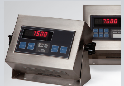
Wide range of digital indicators available for any application.