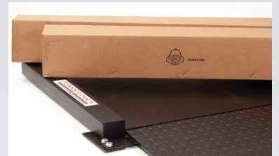
Live side rails facilitate weighing large or oversized items.