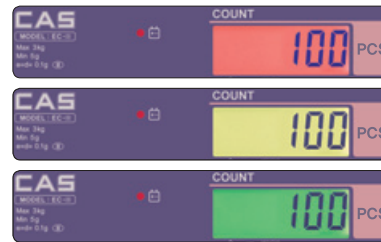
▲ Three backlight colors

Set the weight or count range and the EC-2 will indicate whether the actual weight or count is HI, LO, or OK, with alarm beep sounds and color display indicators. The optional Light Tower offers a larger visual alternative.