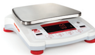
Navigator with square pan and LED display