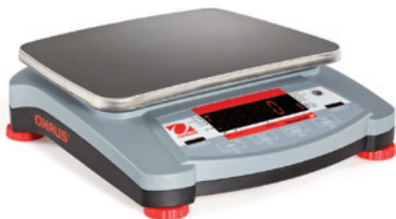
Navigator XT with LED display