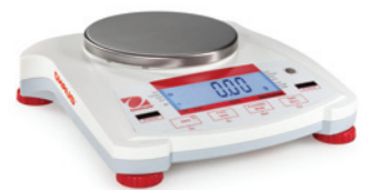
Navigator with round pan and LCD display