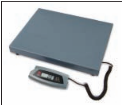
165lb and 440lb models available with large platform