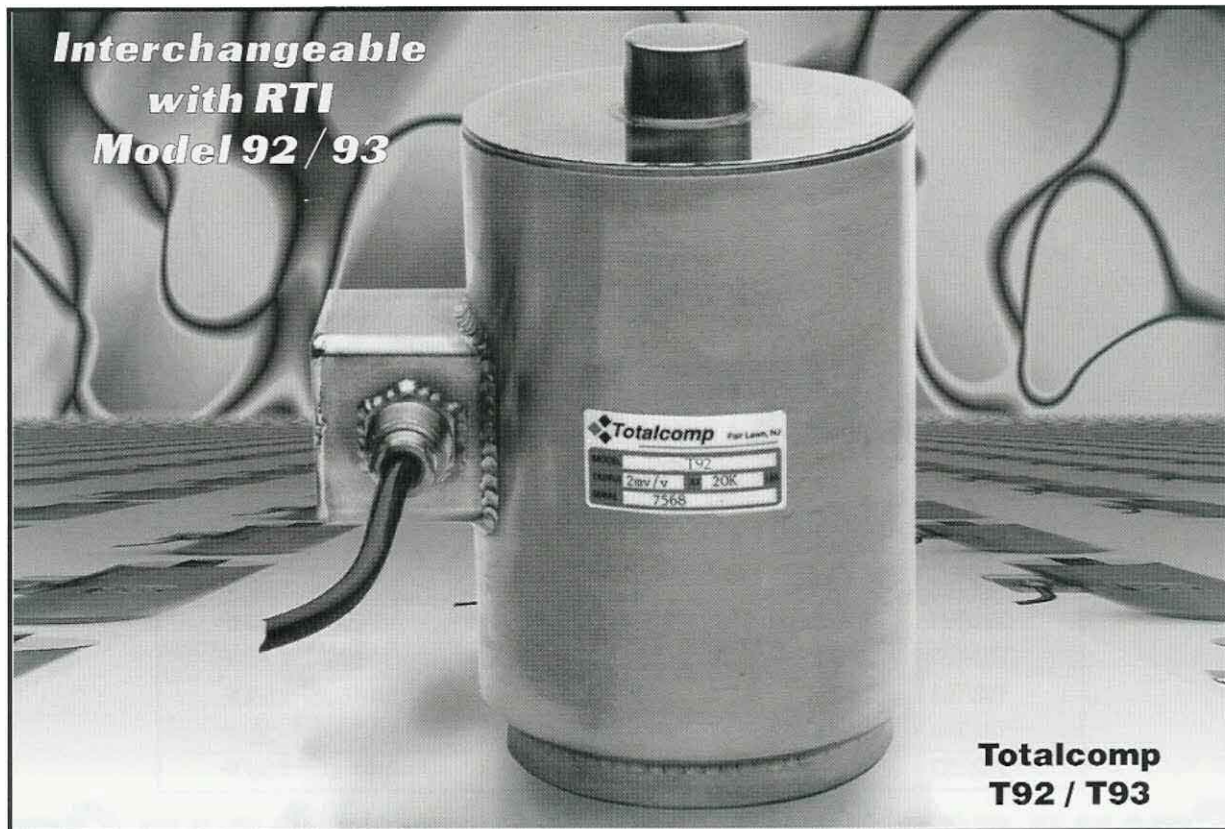
Totalcomp T92 / T93