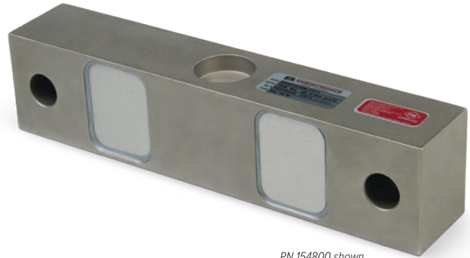
PN 154800 shown