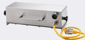
8BIS Battery Pack