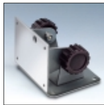
Wall Mount Kit