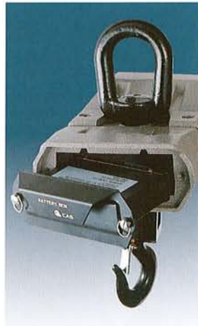
▶ Battery Pack Installation