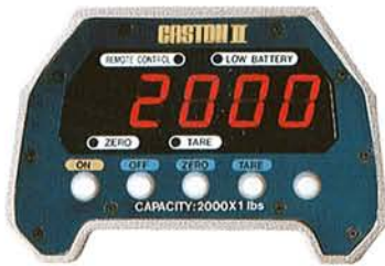
▲ Display & Keyboard