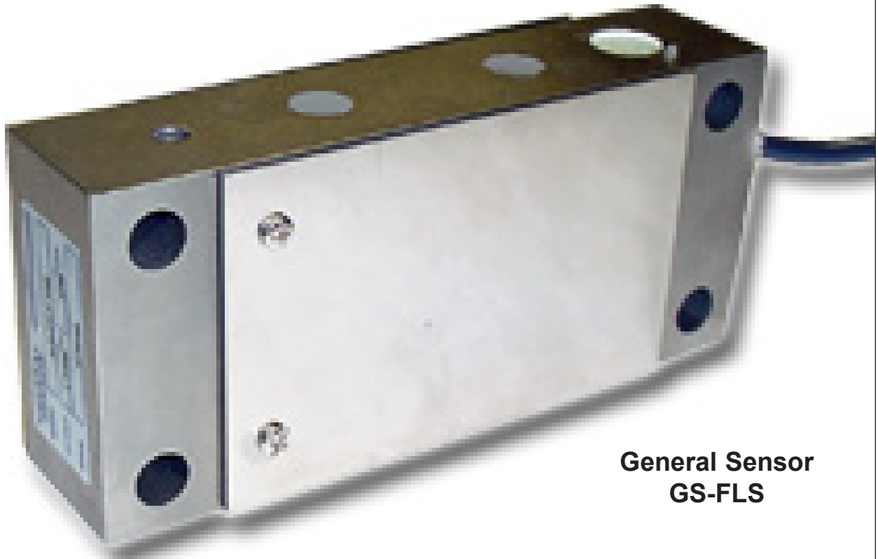
General Sensor GS-FLS