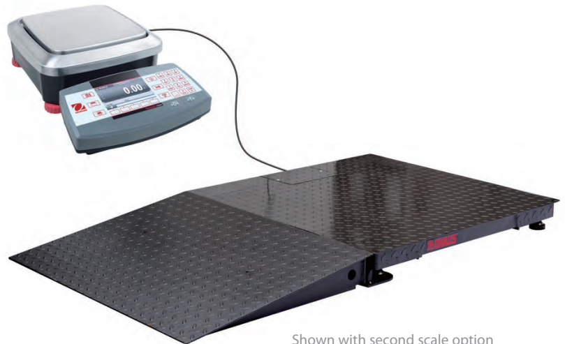
Shown with second scale option

With the remote base option, you can connect a floor scale platform or bench scale base with higher capacity in order to achieve precise results for a job of any size. Results from both scales can be displayed at the same time. Ranger 7000 can control many peripheral devices through the optional Discrete I/O interface (provides 2 input ports and 4 output ports), which can be used for accurate weight measurement in filling and checkweighing applications.