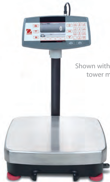
Shown with optional tower mount