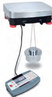
Weight below hook in use

Additionally, a weigh below hook offers the functionality to perform specific gravity tests or weigh items that cannot be easily placed on the weighing platform.