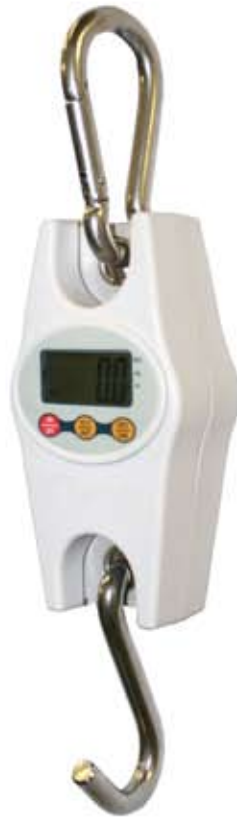
Totalcomp THS Digital Hanging Scale