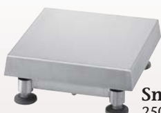
Small 250 mm × 250 mm