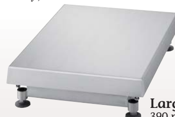
Large 390 mm × 530 mm