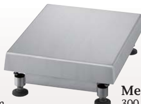
Medium 300 mm × 380 mm