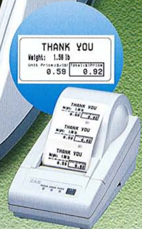
Optional DLP-50 Label Printer