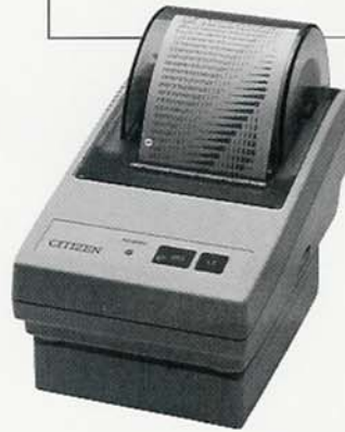
iDP-3110 With Optional BP-10 Battery Pack