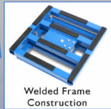
Welded Frame Construction