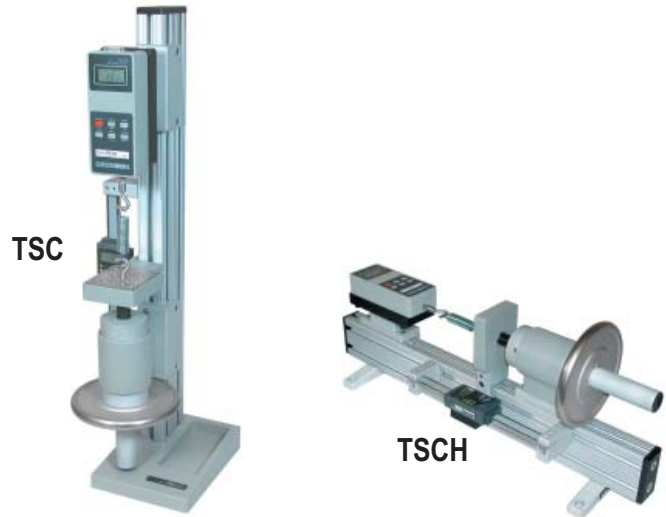
The TSC and TSCH are shown in a tension spring testing application, with Series BG digital force gauge, digital travel display, and hooks