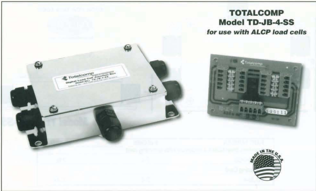
TOTALCOMP Model TD-JB-4-SS for use with ALCP load cells